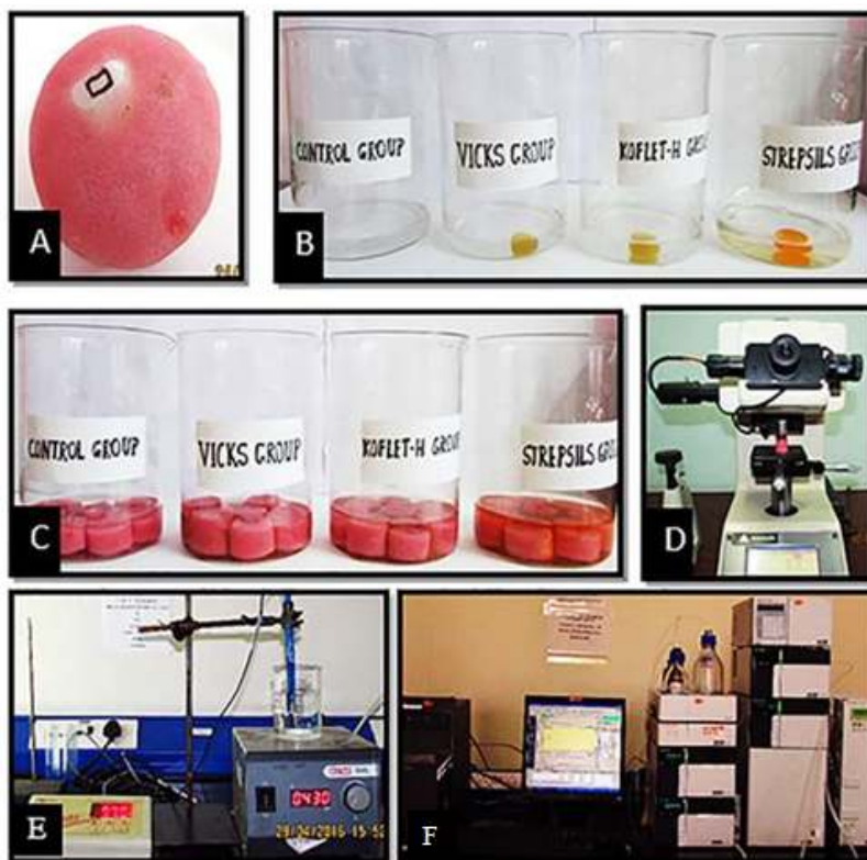
Fig. 1. Procedure (A) Sample preparation, 3 mm x 2 mm enamel window. (B) Cough lozenges immersed in 20 ml of artificial saliva, (C) Exposure of samples to dissolved lozenge mixture (D) Vicker's micro hardness test (E) Evaluation of pH (F) Analytical HPLC

The analyte peaks were identified by comparison with those of respective standard (methanol) for their retention time and the chromatogram was recorded.