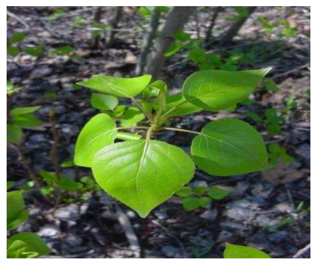
Fig. 4. Populus trichocarpa

natural herbs due to high price based on their aromatic and flavoring qualities. Though, the dependence on synthetic drugs is getting over and people are going back to the naturals with the hope of safety and also of security [17].