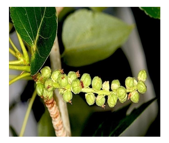
Fig. 3. Cottonwood poplars

There is no calyx or corolla on the female flower, which consists of a single cell ovary situated in a cup-shaped disc. The style is short having 2–4 stigmas that are lobed in diverse ways and a large number of ovules [11]. Wind pollinates the plants, and the female catkins lengthen significantly between pollination and maturity. The fruit is either two or four-valved green to a reddish-brown capsule that matures in the middle of summer. It has a lot of small light brown seeds that are encircled by tufts of long, soft white hairs that help with wind dissemination [12].