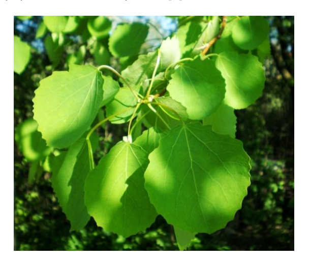
Fig. 1. Populus tree

Over the beyond decades, the cultivation of medicinal flora has started attaining momentum. However still, a significant part of our requirements continues to be met from wild sources. Although there has been a significant increase in the use of herbal medicine in recent years, there is still a significant demand for research data in this field. Medicinal plants are rich sources of components that can be employed in the manufacture of pharmacopoeial, non-pharmacopoeial, and synthetic medications. We can't get away from nature since we are part of it. They must be promoted to preserve human lives [1]. This study aims to review the current knowledge on Populus trichocarpa biological investigations and therapeutic benefits. Populus trichocarpa considered as the first tree whose entire DNA code is decoded. The genome sequence of P. trichocarpa is a significant tool for employing comparative mapping to investigate the structure and function of genomes in the poplar and related species [2].