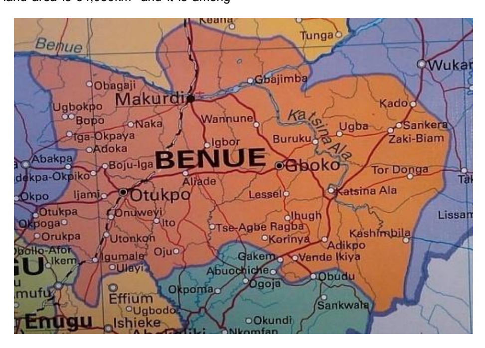
Fig. 1. Map of Benue State Adapted from Dzurgba (2012) Map of Benue State

Cluster and simple random sampling techniques were used to select the respondents for the study. Benue State were clustered into three senatorial districts including North East senatorial district (Zone A) North West Senatorial District (Zone B) and Benue South Senatorial district Zone (C). One Local Government Areas was randomly selected from each of the clustered senatorial districts: Kastina-Ala selected from Zone A; Buruku selected from zone B; and Otukpo Local Government Areas selected from Zone C respectively.