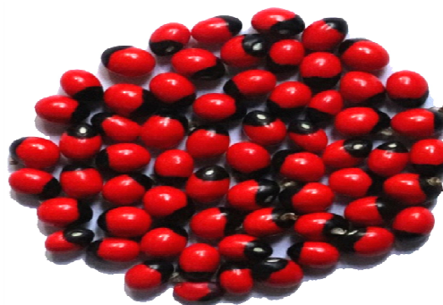
Fig. 1. Image of Abrus precatorius L. seeds.

A group of six A. precatorius seeds were enclosed in the oblong, flat and truncate shaped yellowish colored seed pod (Fig. 1). The seeds were scarlet colored, with a black spot, and featured a globose shape. A 125±3 mg per seed weight was obtained for the samples under study. The seed coat was found to be relatively thick (representing 29±1% of the seed weight), while the kernel fraction accounted for 71±2% of the seed weight. The average water content of the seeds was found to be 3.2±0.1%.