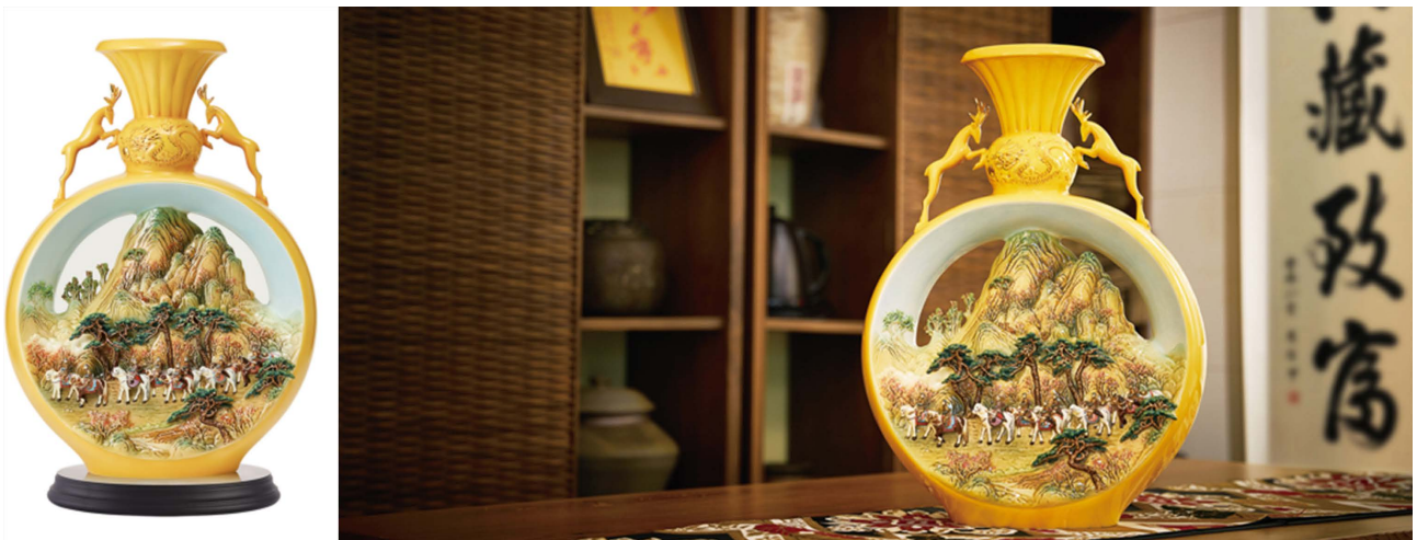
Figure 2. Franz Collection's porcelain items.