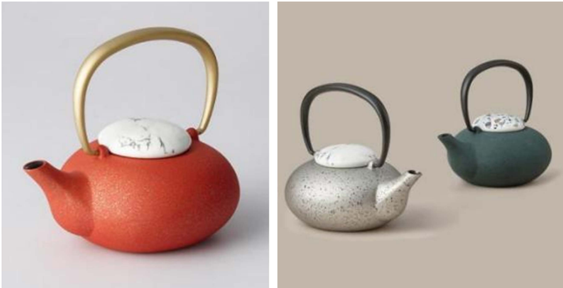
Figure 1. Kikuchi Hojudo's cast iron teapots.