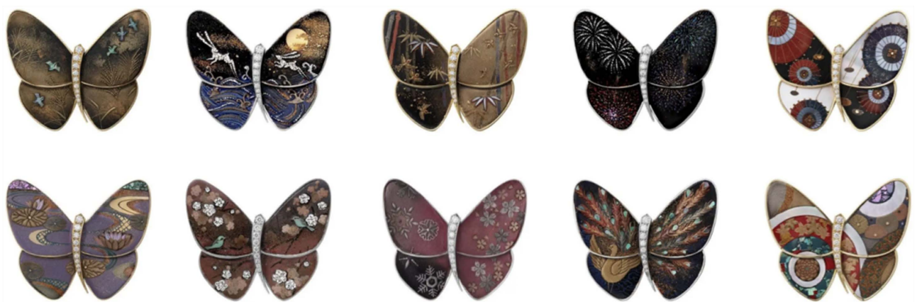
Figure 3. Van Cleef & Arpels & Junichi Hakose painted butterfly brooch.