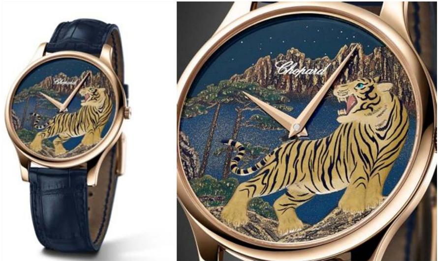
Figure 4. Chopard lacquer art watch.

modern design principles, promoting a fusion of tradition and innovation. This approach not only preserves the rich heritage of traditional crafts but also repositions them within the modern lifestyle, illustrating the potential of traditional beauty in contemporary design.