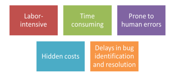
Fig. 1. Limitations of manual testing

The goal of implementing AI in quality assurance is to overcome the bottlenecks in manual testing. Manual testing is a time-consuming process that is prone to human error. It requires significant effort to write, manage, execute test cases, document the outcomes, and verify results. Limitations of manual testing are highlighted in Fig. 1.