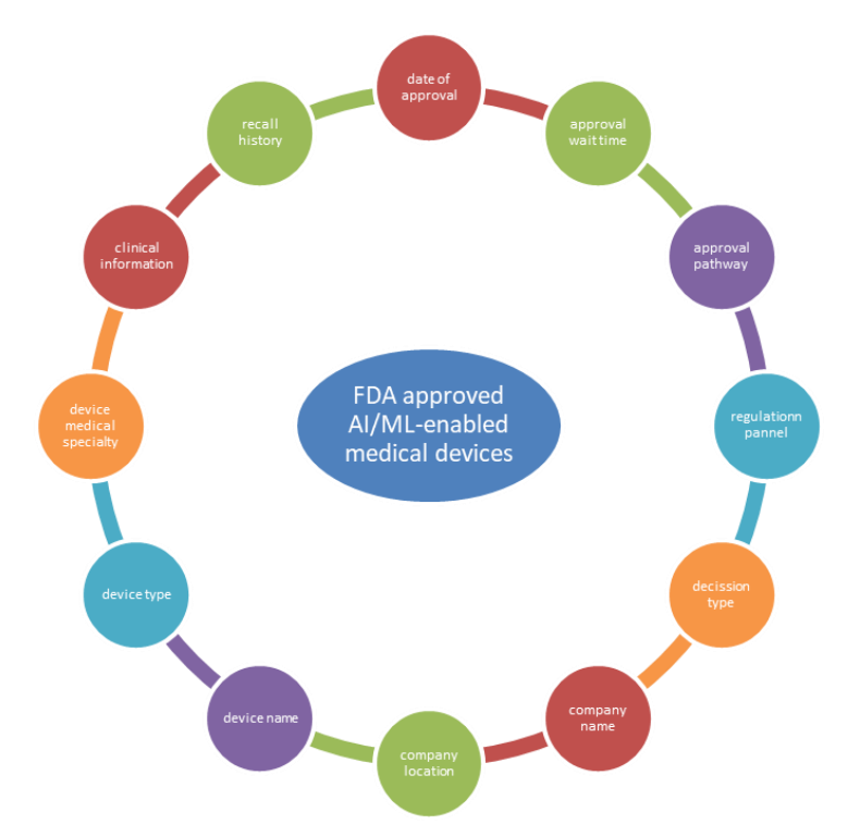
Fig. 4. Factors involoved in the approval of AI enabled medical devices by FDA

Khinvasara et al.; Asian J. Res. Com. Sci., vol. 17, no. 6, pp. 13-35, 2024; Article no.AJRCOS.114807