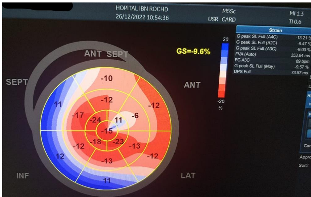
Image 1. Left ventricular global longitudinal strain damage in a patient with a severe mitral stenosis

In our study, mitral stenosis (MS) was the primary valve disease of interest, and we aimed to contribute uniquely to the existing body of research in this field. Notably, there is a scarcity of studies that have assessed mitral stenosis using GLS as a parameter. What sets our study apart is the distinctiveness of examining GLS in a population such as ours. In a context where rheumatic fever stands as the predominant cause of valvular disease, MS emerges as the most prevalent valvular condition.