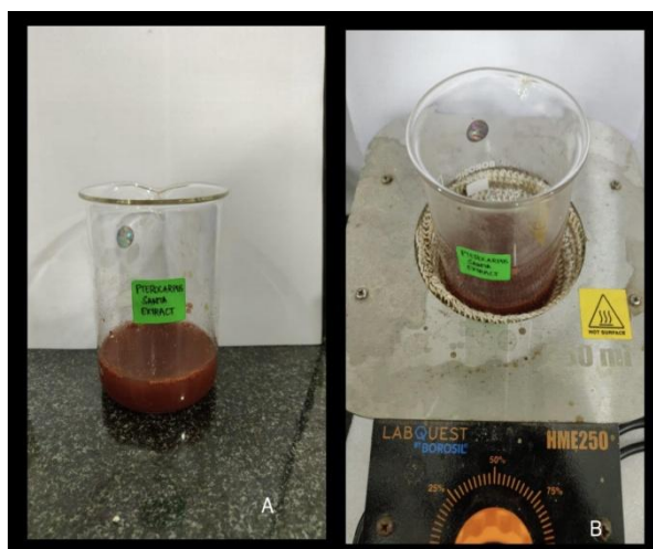
Fig. 1. Synthesis of P.santa mediated selenium nanoparticles