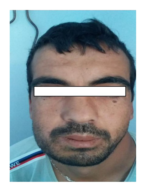
Fig. 7. Right cheek swelling