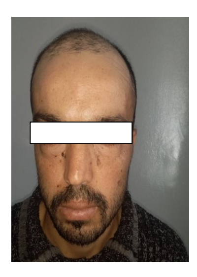
Fig. 5. Facial nevomatosis and protruding frontal bumps