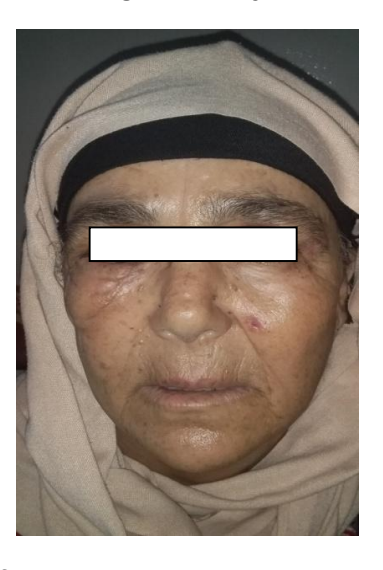
Fig. 4. Picture after eyelid reconstruction (result after 1 month)