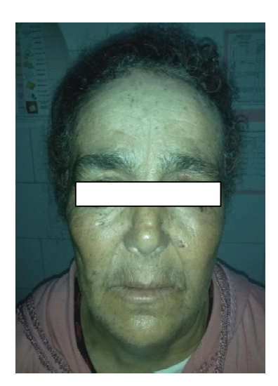
Fig. 3. Nodular lesion of the right lower eyelid and the left upper eyelid

Observation 3: A 39-year-old man (the son), having as an antecedent: 1st degree consanguinity with the above-mentioned patient, on clinical examination presents: a large frontal bump, macrocephaly, diffuse pigmentary lesions at the level of the face and hypertelorism.