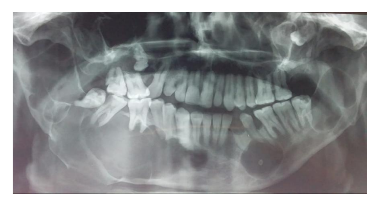
Fig. 8. Tri-focal cystic image

Clinically, this condition is characterized by a spectrum of developmental abnormalities and a predisposition to different cancers [4].