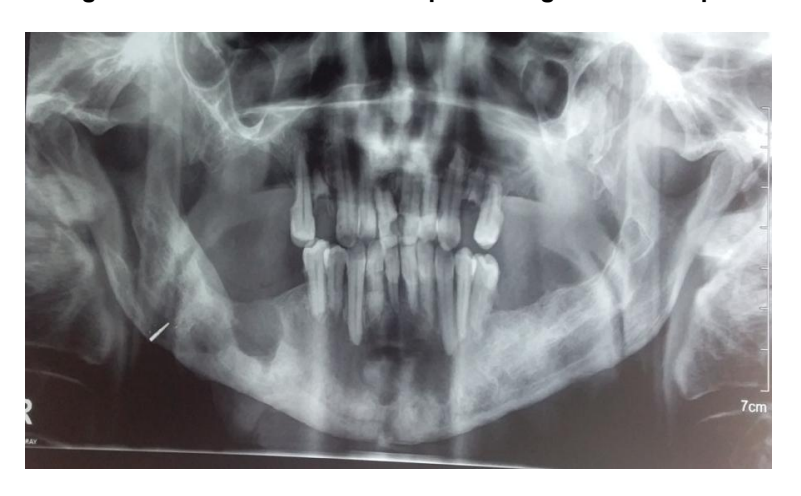
Fig. 6. Mandibular cystic images

An excision of the mandibular cyst was performed, the pathological examination was in favor of an odontogenic keratocyst