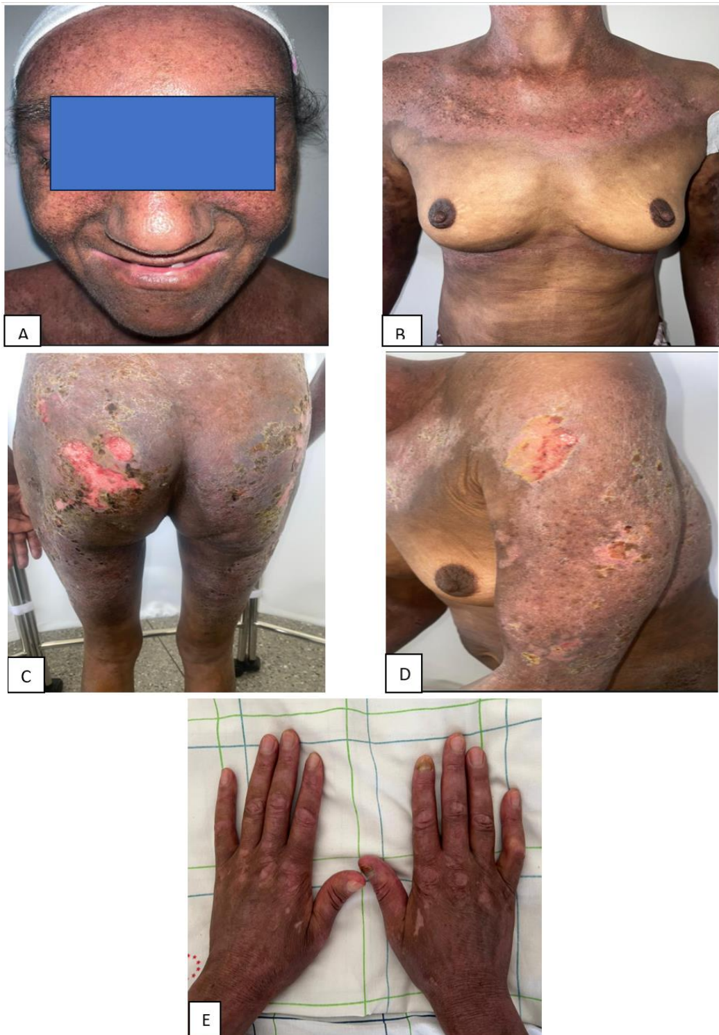
Fig. 1. A: A lilac-colored erythema on the eyelids. B: Extensive, symmetrical, erythematous and purplish macules on the décolleté (V-shaped erythema), and poikiloderma C,D: Several post-bullous erosions on the upper and lower limbs. E: Erythematous macules arranged in bands along the extensor tendon sheaths and strengthening opposite the MCP and IPP joints (Gottron sign)