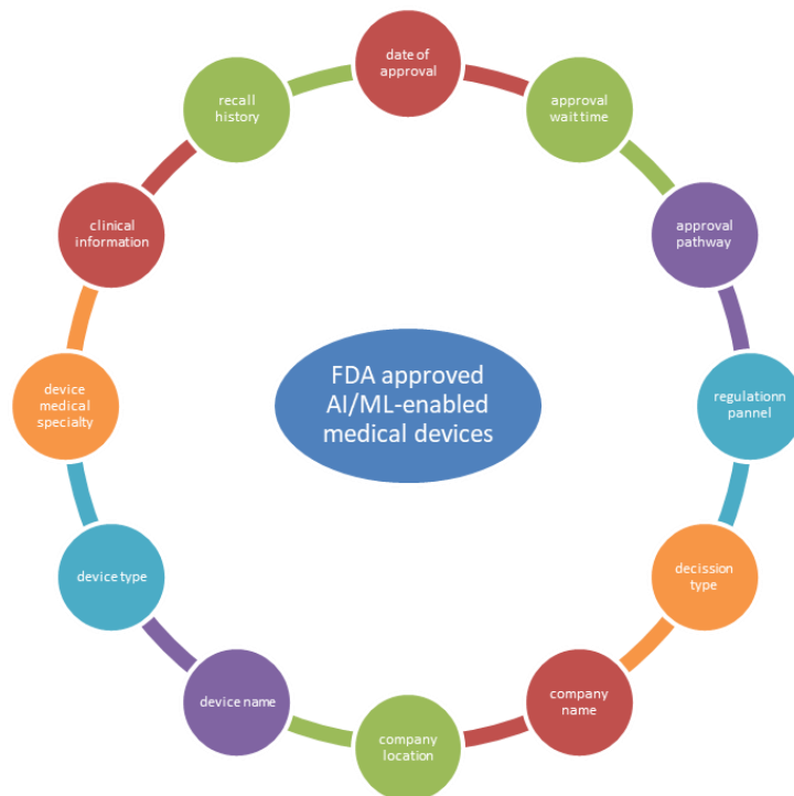
Fig. 4. Factors involved in the approval of AI enabled medical devices by FDA

The Intricate Nature of Regulations and the Burden of Ensuring Compliance: A primary obstacle in ensuring quality assurance in the medical industry is the intricate regulatory environment. Healthcare regulations are complex and undergo regular revisions, which makes it challenging for healthcare providers and organisations to ensure compliance. The task of navigating through many rules such as HIPAA (Health Insurance Portability and Accountability Act), FDA (Food and Drug Administration) requirements, and CMS (Centres for Medicare & Medicaid Services) guidelines presents substantial difficulties. In addition, the differences in regulatory standards among various locations contribute to the intricacy, particularly for healthcare organisations operating in multiple countries. Complying with these regulations requires significant resources, effort, and skill. Noncompliance can result in significant repercussions, such as legal sanctions, loss of accreditation, and harm to one's reputation [168].