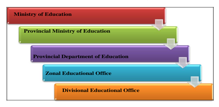
Fig. 1. Educational administrative hierarchies in Sri Lanka