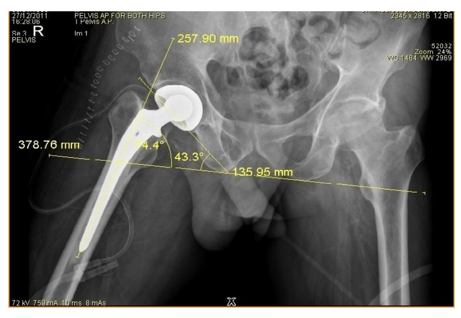
Fig. 4. X-ray of pelvis with both hips (Abduction of operated hip) with Bipolar prosthesis on right side showing Angle A1 – 43.3 and Angle B1 – 74.4 degrees

A = 45.1, B = 83.4, A1 = 43.3, B1 = 74.4 (DEGREES)