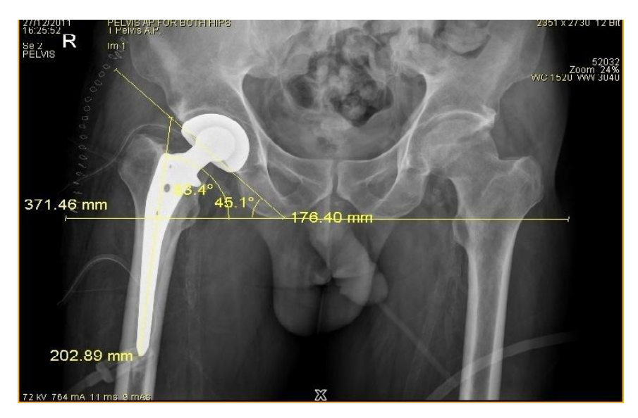
Fig. 3. X-ray of pelvis with both hips (neutral position) with Bipolar prosthesis on right side showing Angle A – 45.1 and Angle B – 86.4 degrees