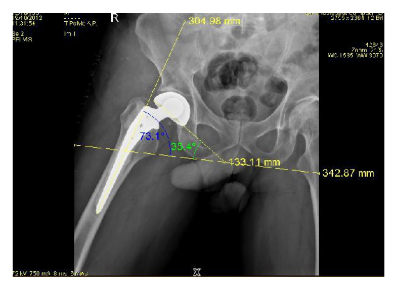
Fig. 2. X-ray of pelvis

The same process will be repeated on the maximum abduction AP X-ray also and angles are marked as A1 and B1.