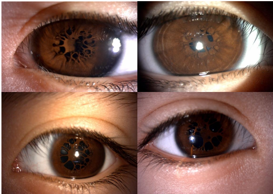
Fig. 1. Persistence of the bilateral pupillary membrane before and after dilation, dense membrane occluding the visual axis in both eyes

After injection of the viscoelastic, the pupillary membrane was resected by a Vannas micro-scissors (Fig. 2). the corrected postoperative visual acuity was 02/10 in both eyes (Snellen's visual acuity), the refraction under cycloplegia