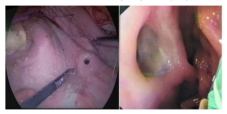
Fig. 2. A. Laparoscopic view showing a 1 cm gastric perforation, B. Endoscopic view showing the perforated gastric ulcer

Fig. 1. CT scan showing intragastric balloon, with pneumoperitoneum and moderate intraabdominal fluid collection in the perihepatic and perisplenic area