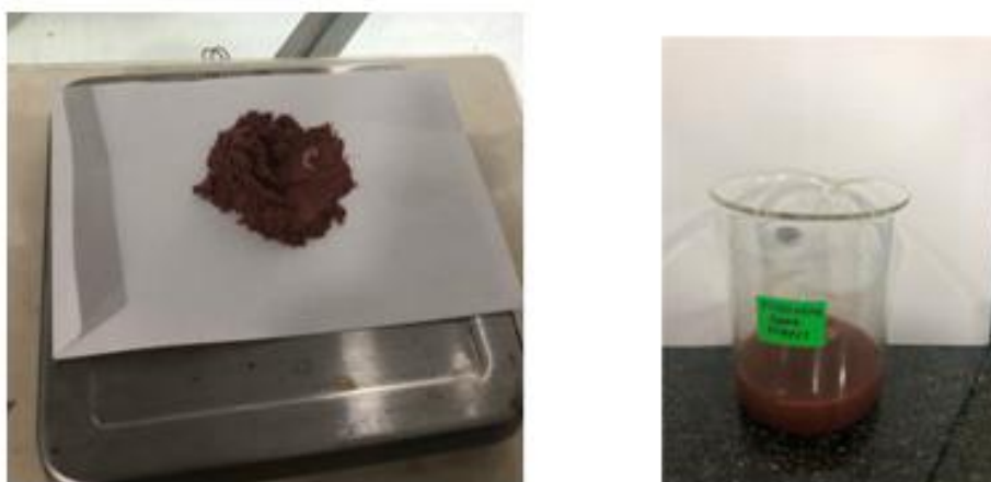
Fig. 1. 1g of Pterocarpus santalinus powder weighed and taken

Then the nanoparticles were added according to the concentration level. The plates were incubated for 24 hours. After 24 hours, the ELISA plates were observed and noted for the number of live nauplii present and calculated.