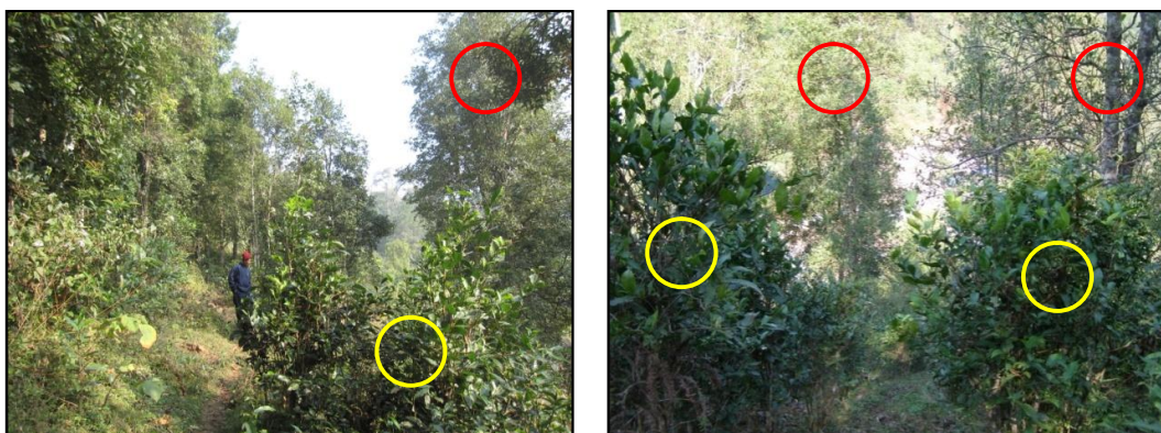
Fig. 1. Illicium verum +tea agroforestry system. Yellow circles indicate teas and red circles indicate I. verum trees