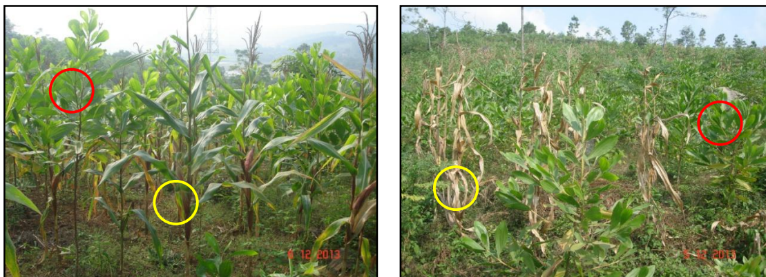
Fig. 4. Acacia mangium + maize agroforestry system. Yellow circles indicate maize and red circles indicate A. mangium trees