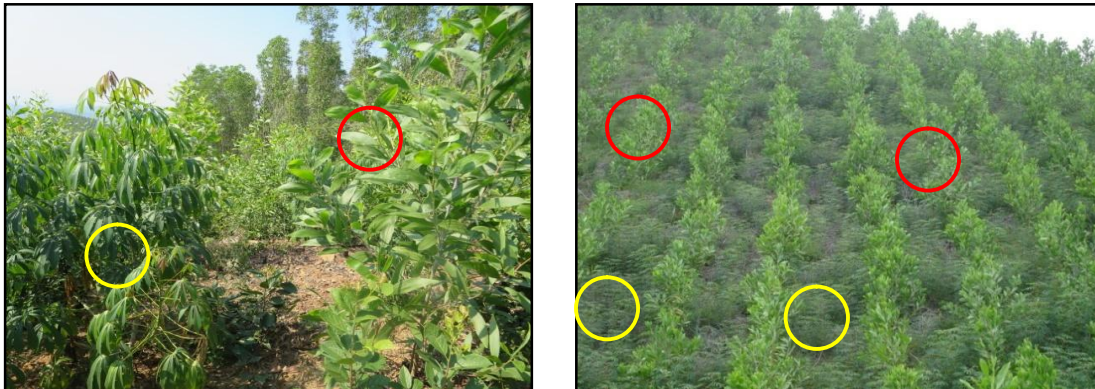
Fig. 3. Acacia hybrid + cassava agroforestry system. Yellow circles indicate cassavas and red circles indicate A. hybrid trees

however, is that these agroforestry systems are often established and expanded through farmers' own efforts without directive or government support, leading to no clear market strategy for agroforestry products [15]. During the establishment, the price of products is high, but usually decreases as a result of oversupply and also because farmers do not have marketing contracts with buyers. In some cases, farmers are not able to sell their products, which led them to abandon or shift their practices. Clearly, agroforestry investment is constrained by lack of stable markets. This issue calls for three important actions by local governments as follows: (i) Mediating between farmers and companies/exporters to develop a clear marketing strategy or agreement; (ii) Facilitating planning with farmers as to the areas that can be legally planted to or converted to agroforestry; and (iii) Providing technical and financial support to farmers [16].